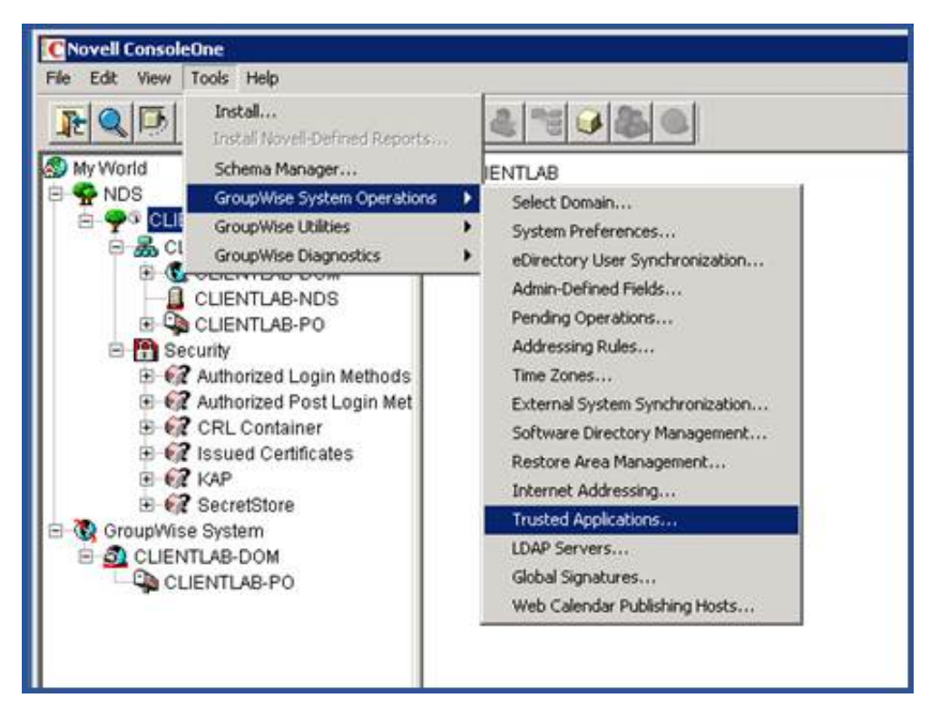
The Configure Trusted Application dialog box appears.